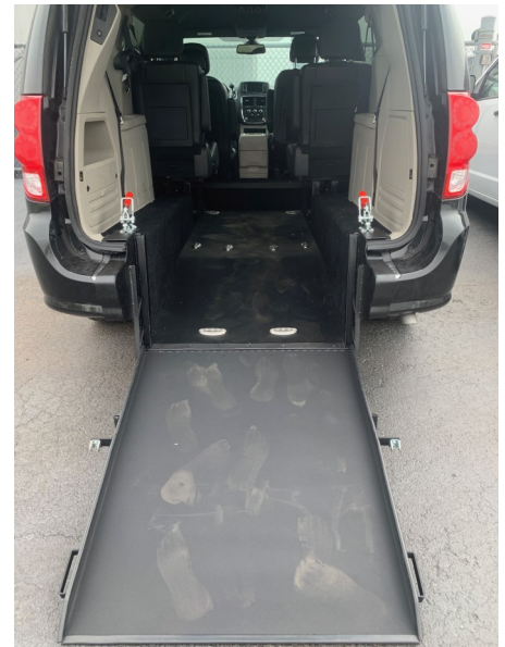
Evanston's New Wheelchair Van