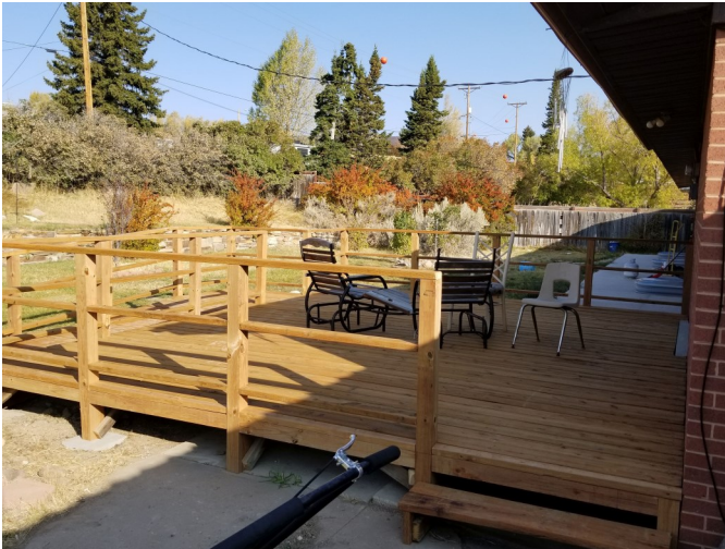
Freedom House, Kemmerer, New Back Deck