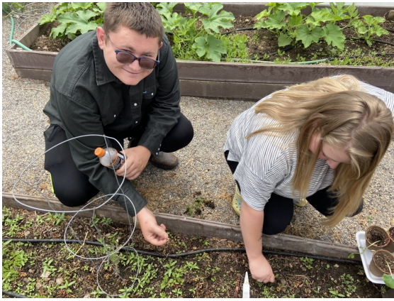
Above: LSR Client and Staff Working In The Garden