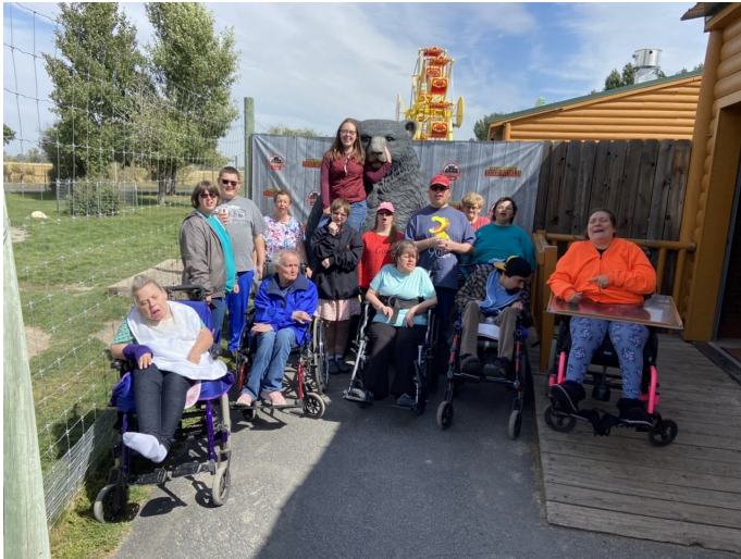
Left Top: LSR Clients Enjoying Rexburg Bear World