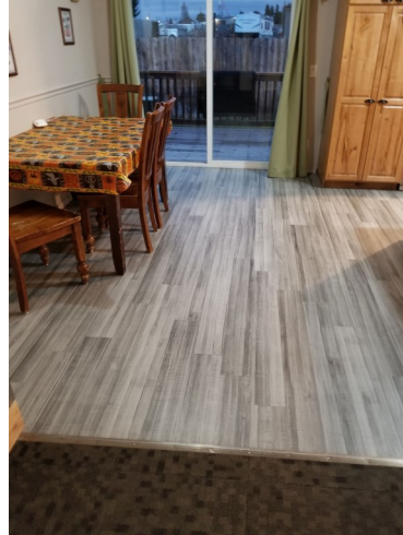
Left: Oakwood, Afton, New Flooring In The Kitchen