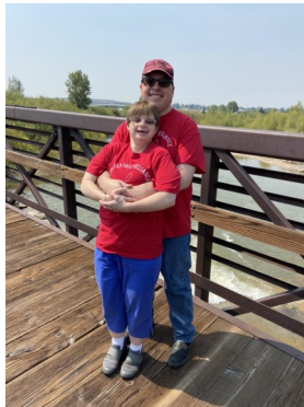
Right: LSR Clients Enjoying A Sunny Walk