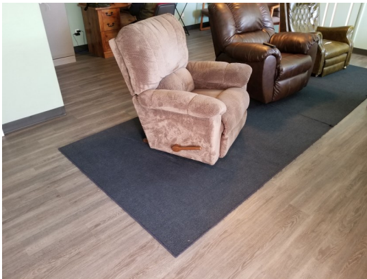
Below: Evanston Training Room New Flooring