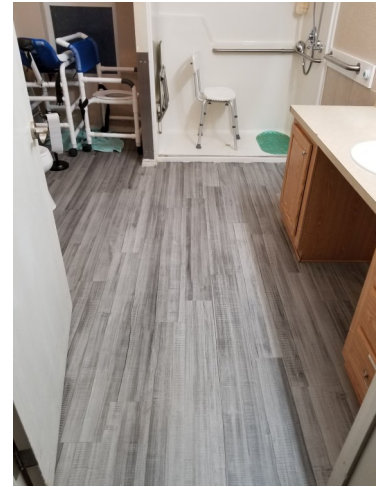
Below: Oakwood, Afton, New Flooring Bathroom