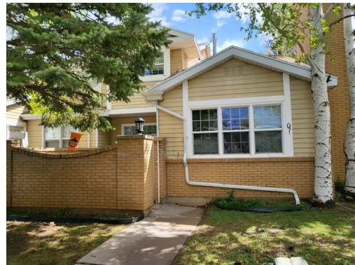
Aspen, Evanston Newly Purchased Town Home