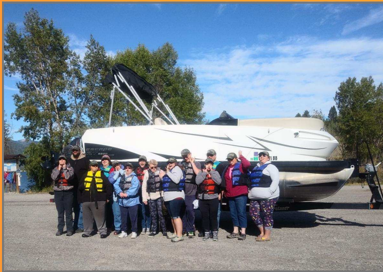
A big Thank You to Jackson Hole Adventure Rental and First Bank for a wonderful day full of sun, fun, and food!

This quarter Thayne office has been very busy . In July we had a great time going on a few picnics, a hike, a rodeo and even did a little fishing. Some of the clients enjoyed going to an outdoor Suzy Bogguss concert. August was just as busy as we spent a lot of time at the fair. As always we enjoy volunteering at the LSR food booth. We went to concerts, various performances, Motor Cross, and rodeos. Also this Fall while the weather was nice we went to Bear Lake and stopped for a shake.