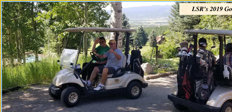
LSR's 2019 Golf Tournament