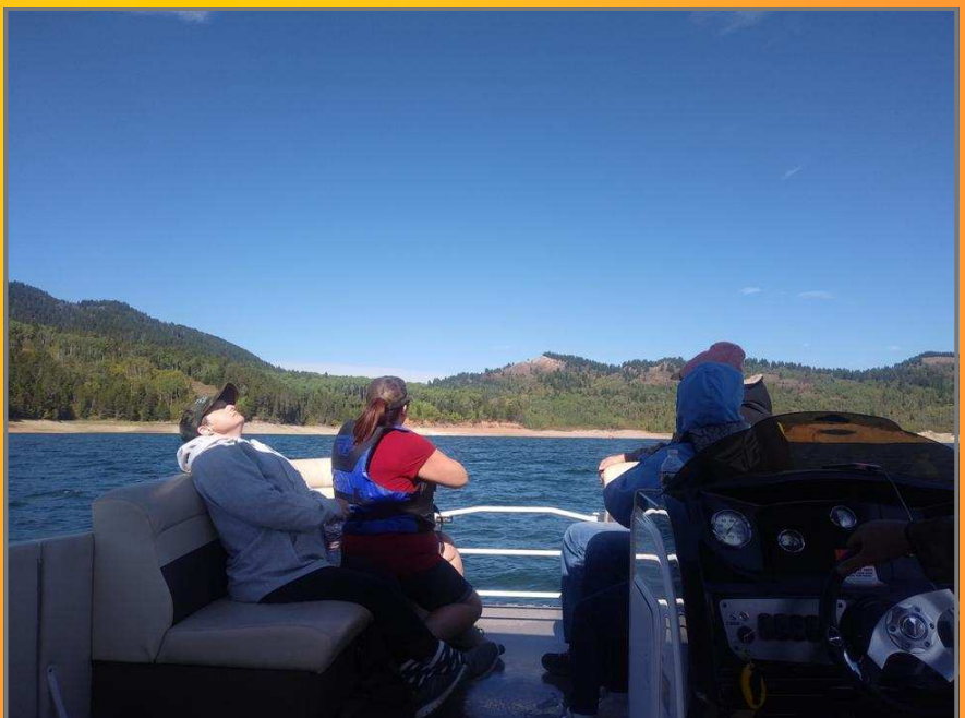
It was a perfect day to be on the water for fun and relaxation!!