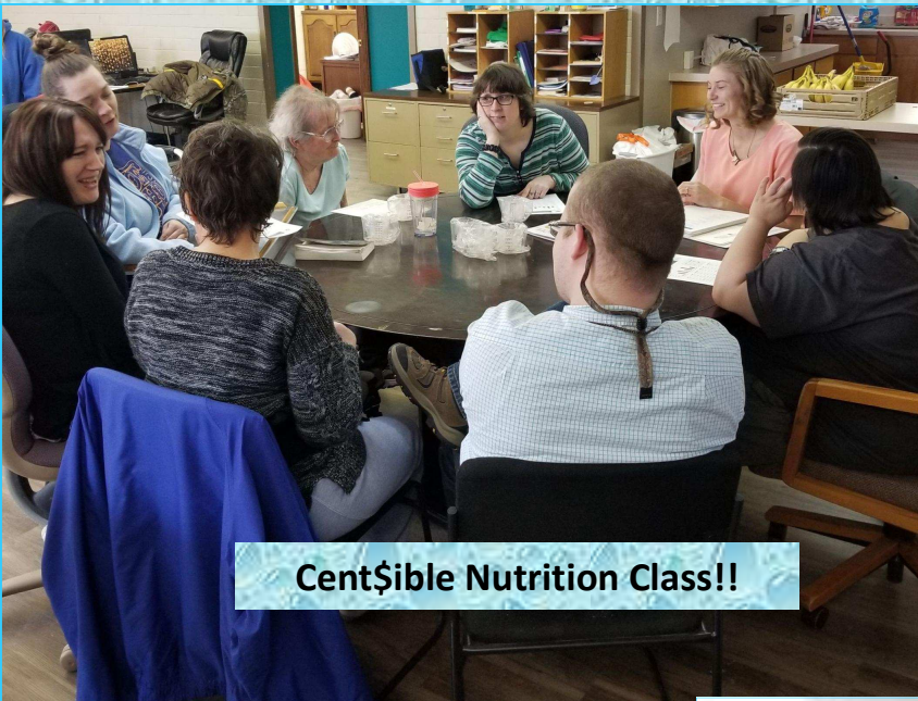
Cent$ible Nutrition Class!!