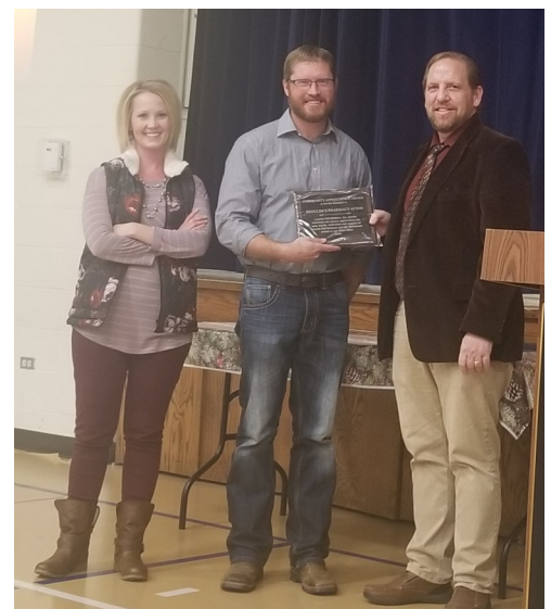
Photo: Broulims Pharmacy Accepting 2019 Service Award