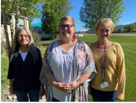
Above: Afton Administrative Staff Below: Evanston Administrative Staff