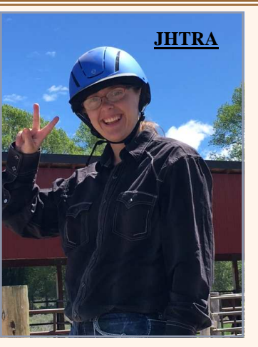
Jackson Hole Therapeutic Riding Association