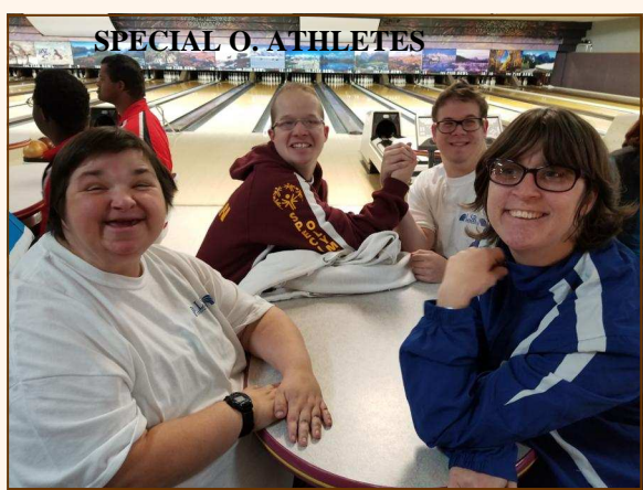
We enjoy all kinds of acitivities!