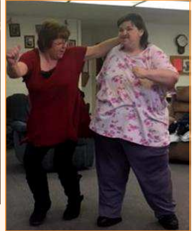
Doin the twist!