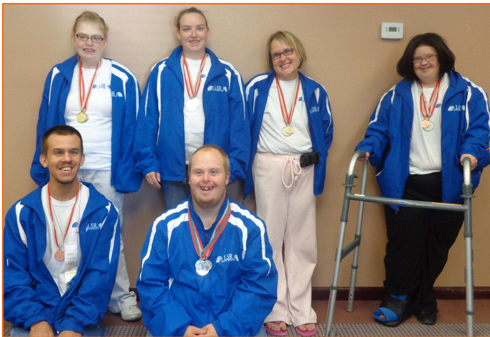
EVANSTON LSR SPECIAL OLYMPICS ATHLETES 2014

May 21st,22nd,23rd- STATE SPECIAL OLYMPICS