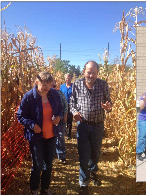
Evanston Corn Maze Adventure