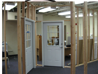
We have construction!

permits but everything has been worked through. The office remodel will greatly improve the working conditions for the case management and office manager staff. LSR has continued to look at available properties in the Kemmerer/Diamondville area to open our first 24-hr. residential home in South Lincoln County. Proposals will be presented to the board of directors in at our January meeting on possible homes that would be suitable for a residential home. LSR will need to hire approximately 4 to 5 new staff for the home when fully occupied. I am also excited to share that our