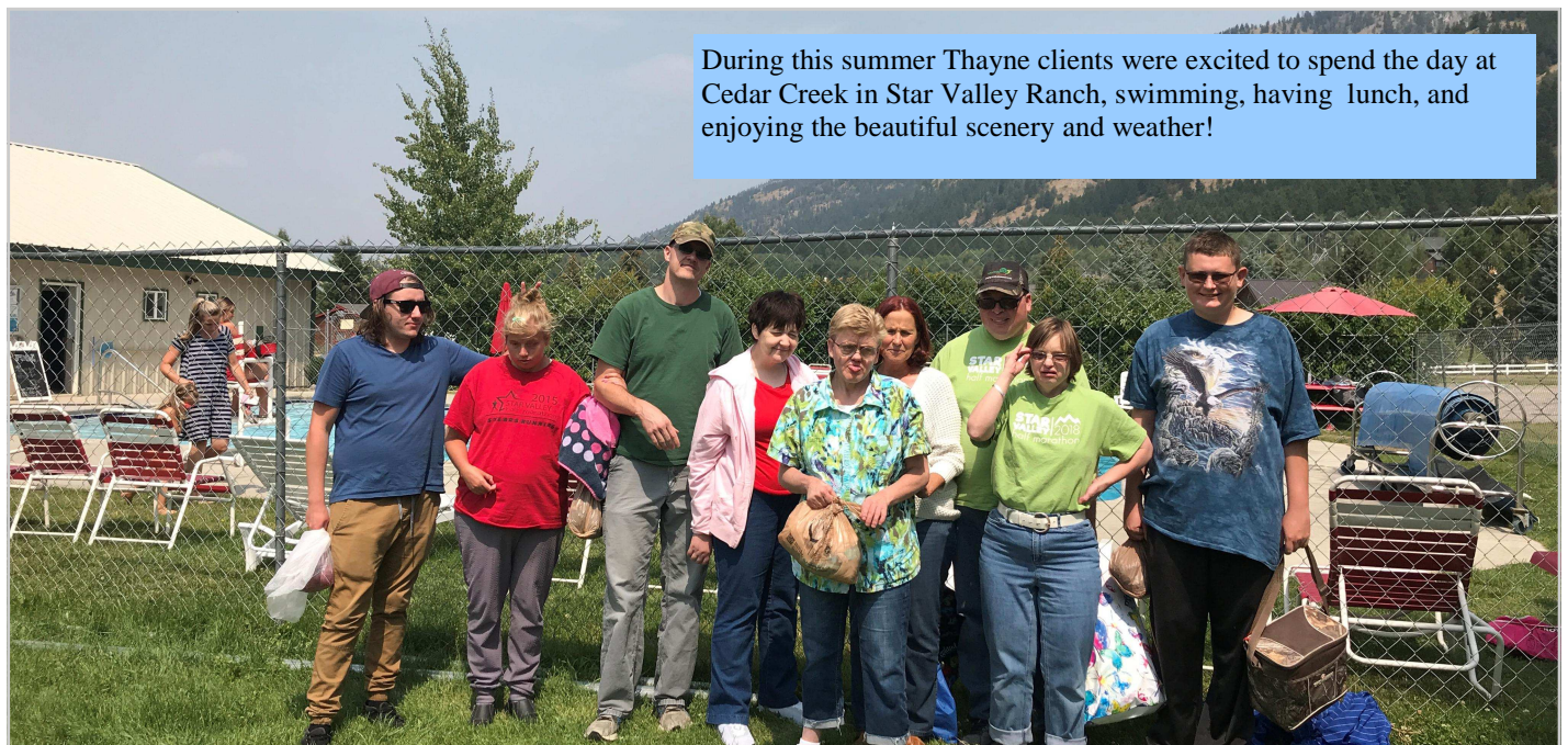
During this summer Thyne clients were excited to spend the day at Cedar Creek in Star Valley Ranch, swimming, having lunch, and enjoying the beautiful scenery and weather!