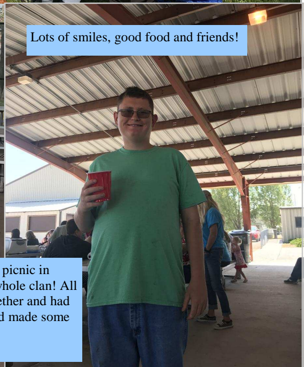
Lots of smiles, good food and friends!